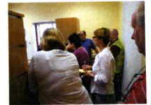
Site Meeting with Contractors