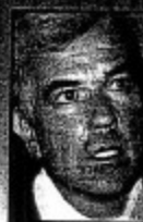
FROM THE SHOULDER