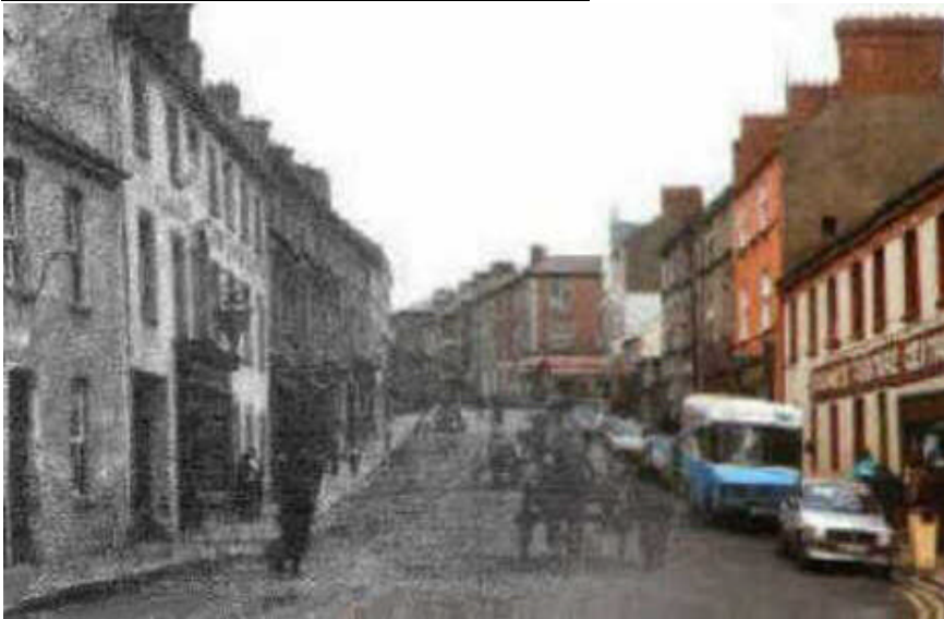
Bridge Street, Tipperary Town, unchanged from 1800 to the present day.

Christ the King Monument, Glen of Aherlow, Co Tipperary – Helen Morrissey 062 Excel Centre, Market Street, Tipperary, 062 82050 (Theatre, Cinema, Exhibition Centre) Maid of Erin Statue, Main Street/Church Street Cross, Tipperary Kickham Monument, Kickham Place/Main Street, Tipperary 'Famine Monument' & Graveyard